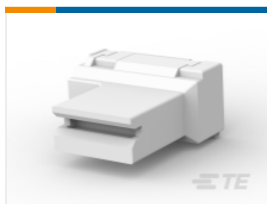
TE Part # 1969656-1 250 FASTON HSG., FLAG, REC., 1 POS, NATRUAL