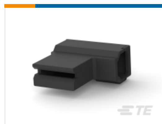
TE Part # 1969657-1 250 FASTON HSG., FLAG, REC., 1 POS, BLACK