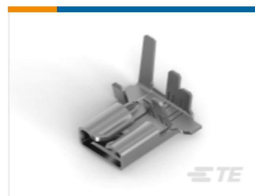
TE Part # 2238171-3 250 FASTON, FLAG, REC., 22-12 AWG, TPBR