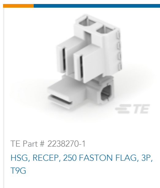
TE Part # 2238270-1 HSG, RECEP, 250 FASTON FLAG, 3P, T9G

Also in the Series | Potter & Brumfield T9G